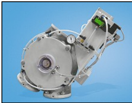
PTD with inflatable seals