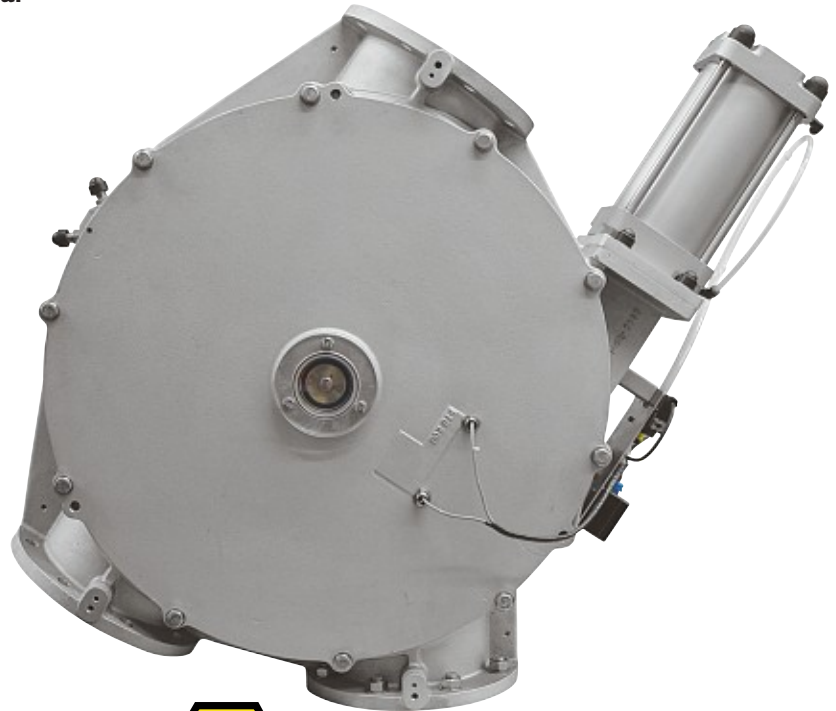
PTD with static seals